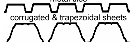
corrugated & trapezoidal sheets